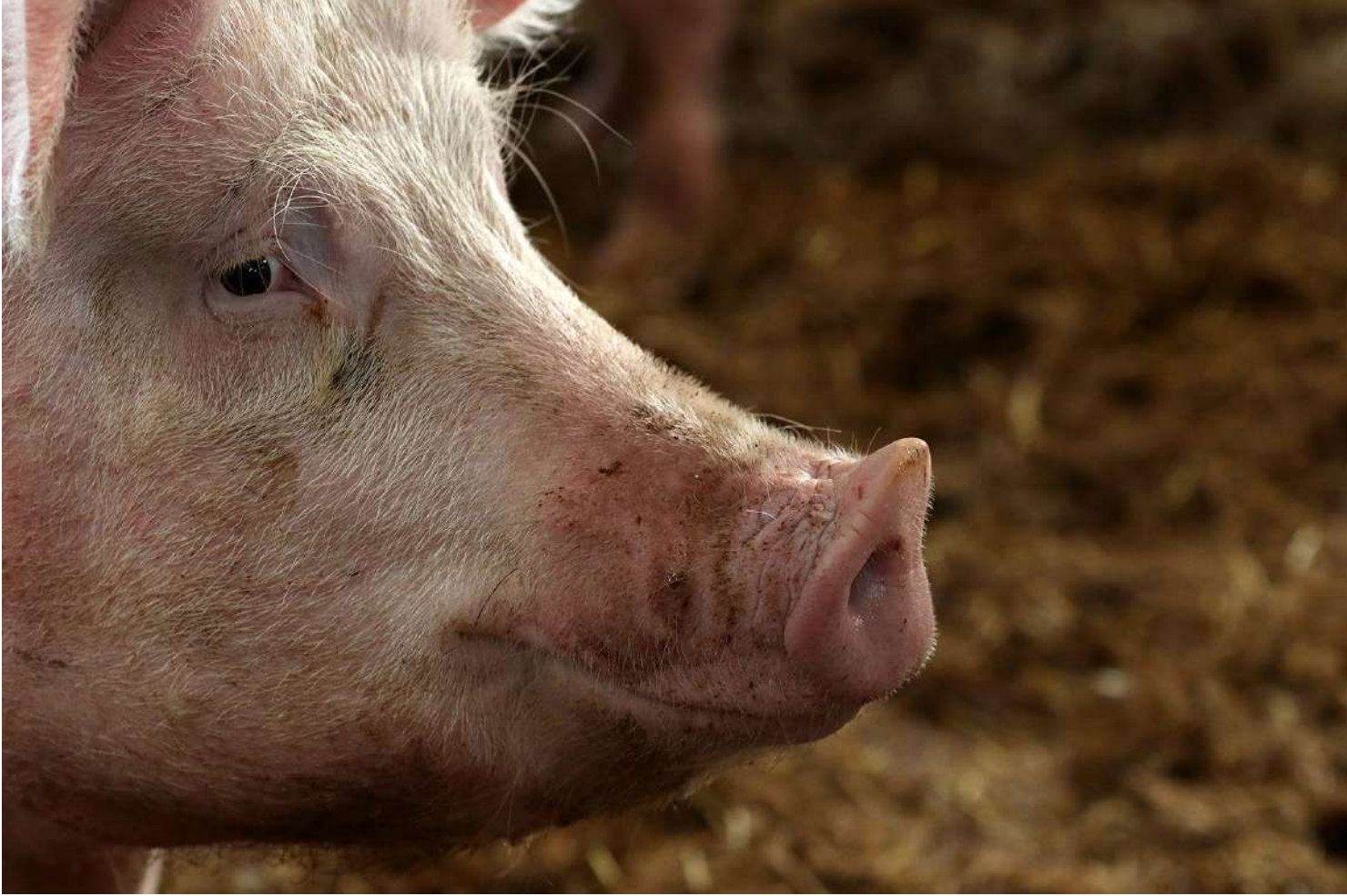
Above: Mother pig in group housing with straw to explore and forage in. Straw also provides additional fibre in her diet.