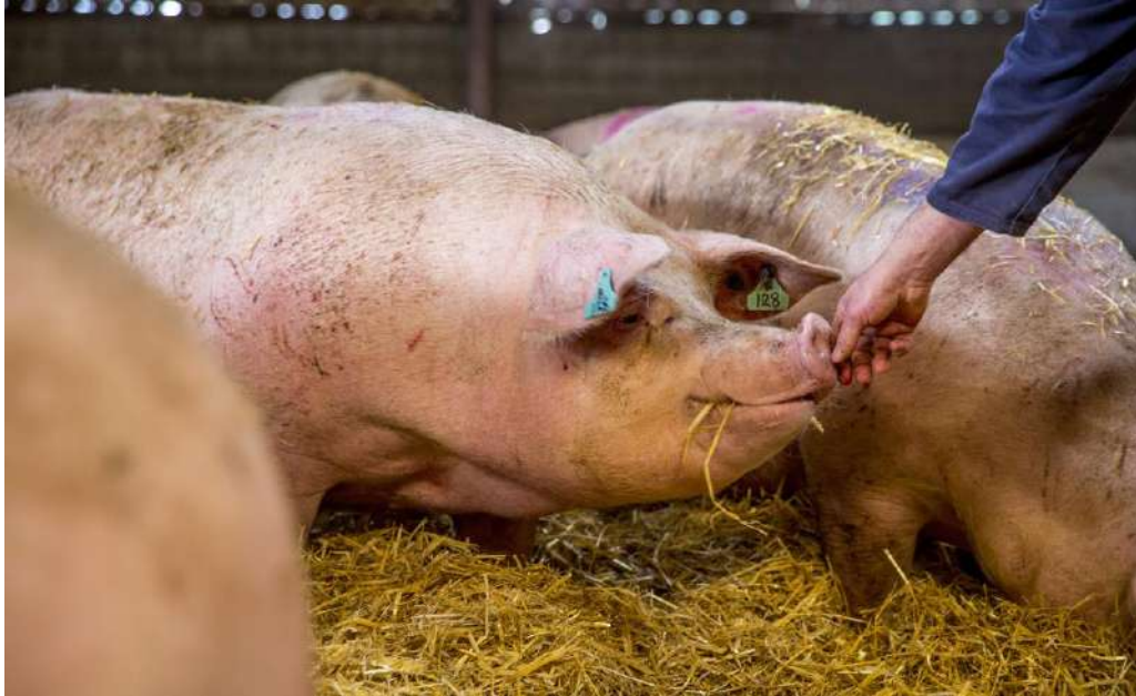
Left: Mother pig in group housing with straw to explore and forage in. Straw also provides additional fibre in her diet.