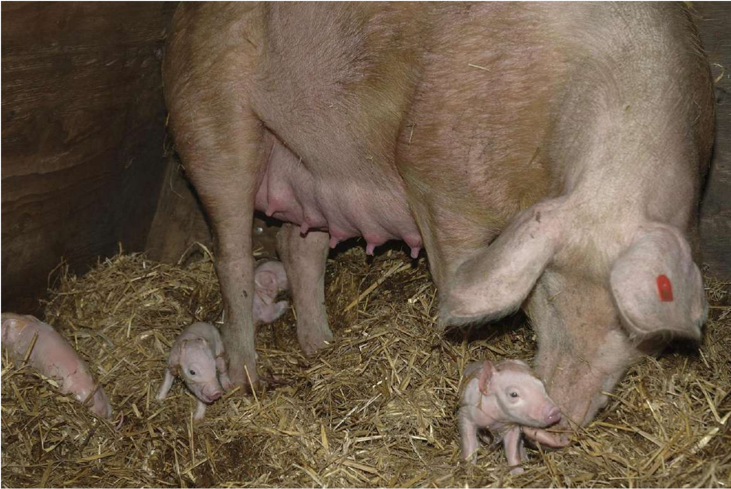
Above: Mother pig able to properly mother her piglets in a pen, not a cage. Straw allows pigs to explore and forage and also provides additional fibre in the diet.