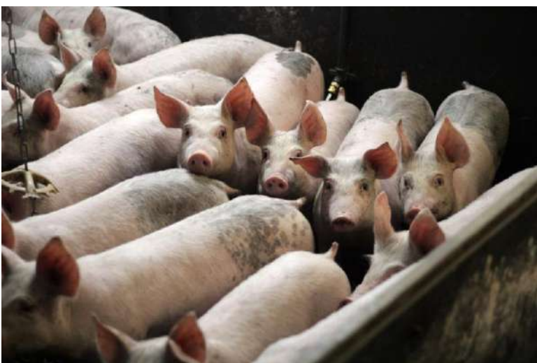
Left: A group of pigs. There is no ear notching, which is good, however all pigs are tail docked.

Higher welfare farming methods already practiced by responsible suppliers worldwide must be rolled out globally. This report shows how such action will reduce the need for routine overuse of antibiotics and protect people's health from the superbug crisis.