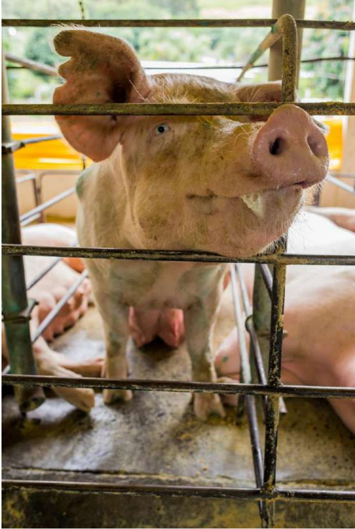
Left: Pregnant mother pig in a cage.