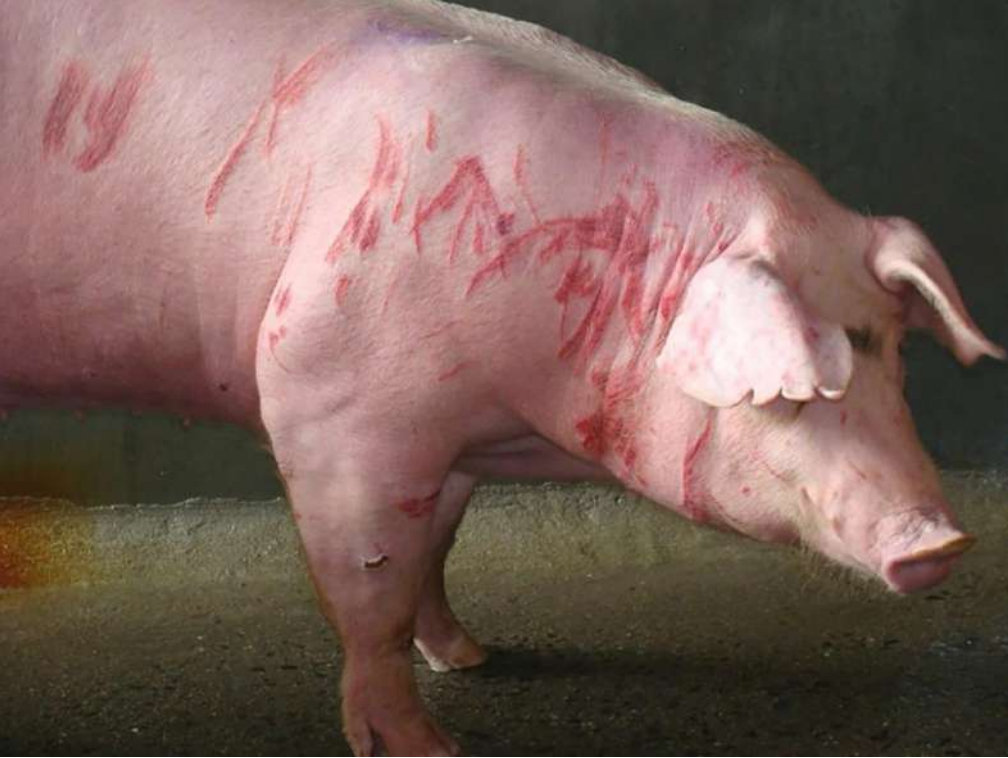
Left: An injured pig after a fight with other pigs. Fighting is exacerbated by stress from barren environments