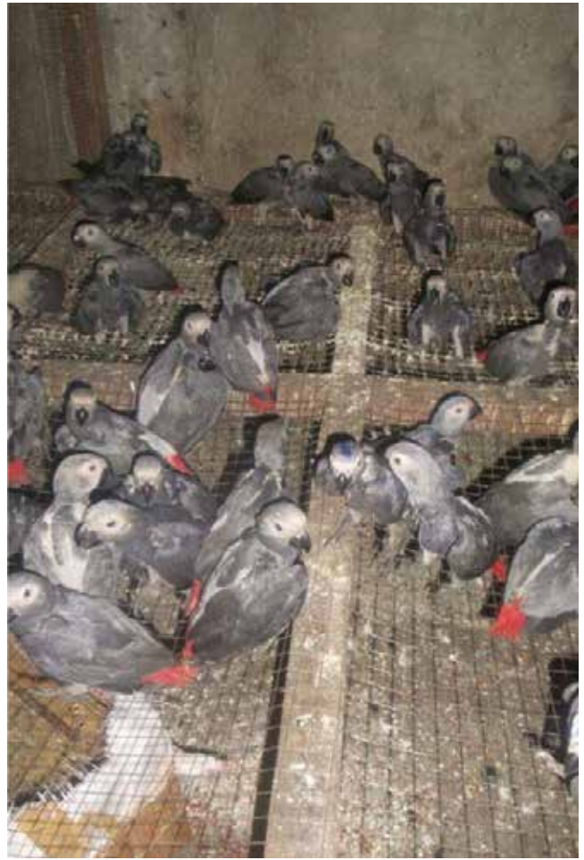
Above: African grey parrots during transportation.

World Animal Protection is calling on Turkish Airlines to stop transporting all birds, until it’s sure African grey parrots and other protected species aren’t being flown illegally on its planes.