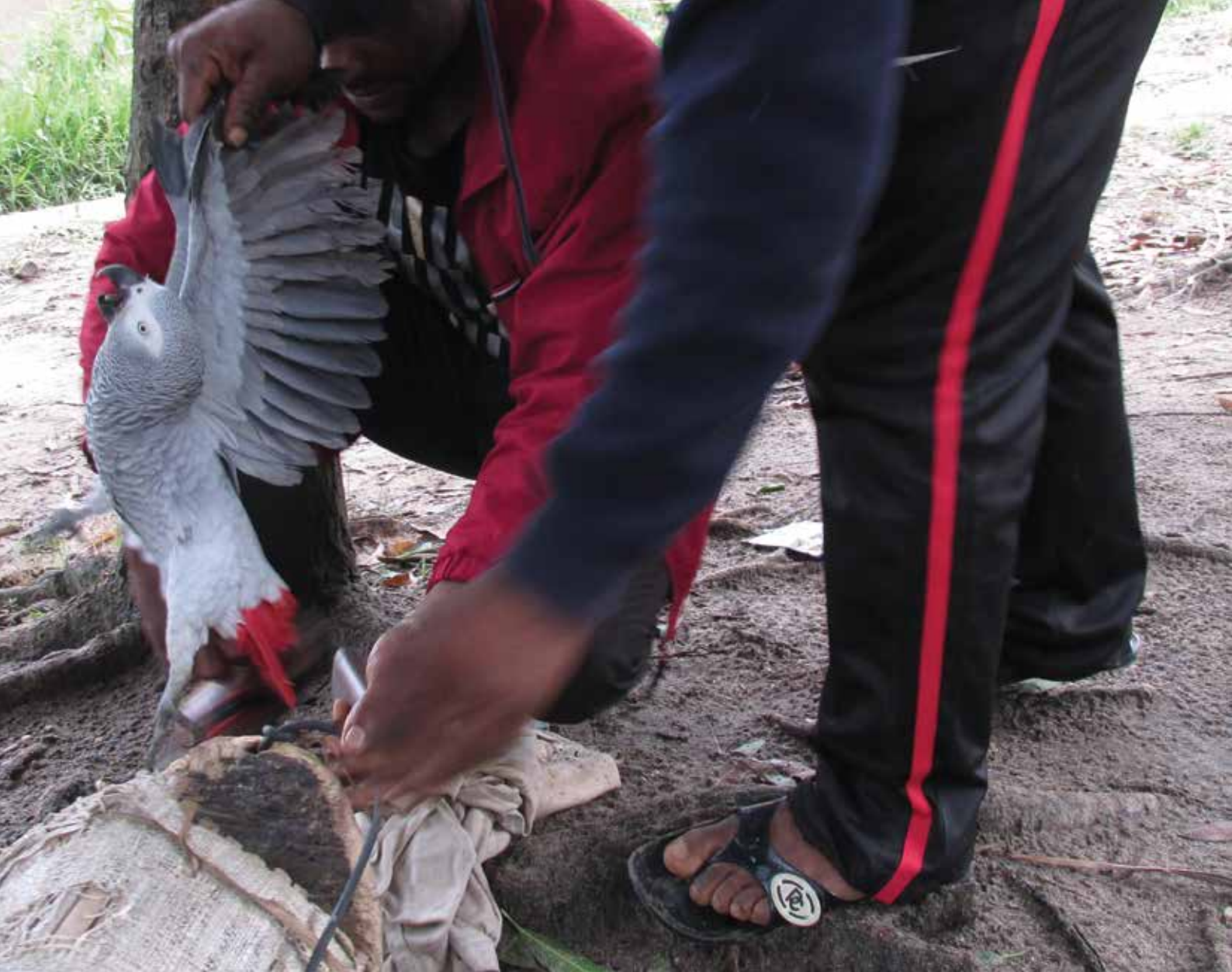
Image: Captured grey parrots being put in a basket for transport to market.