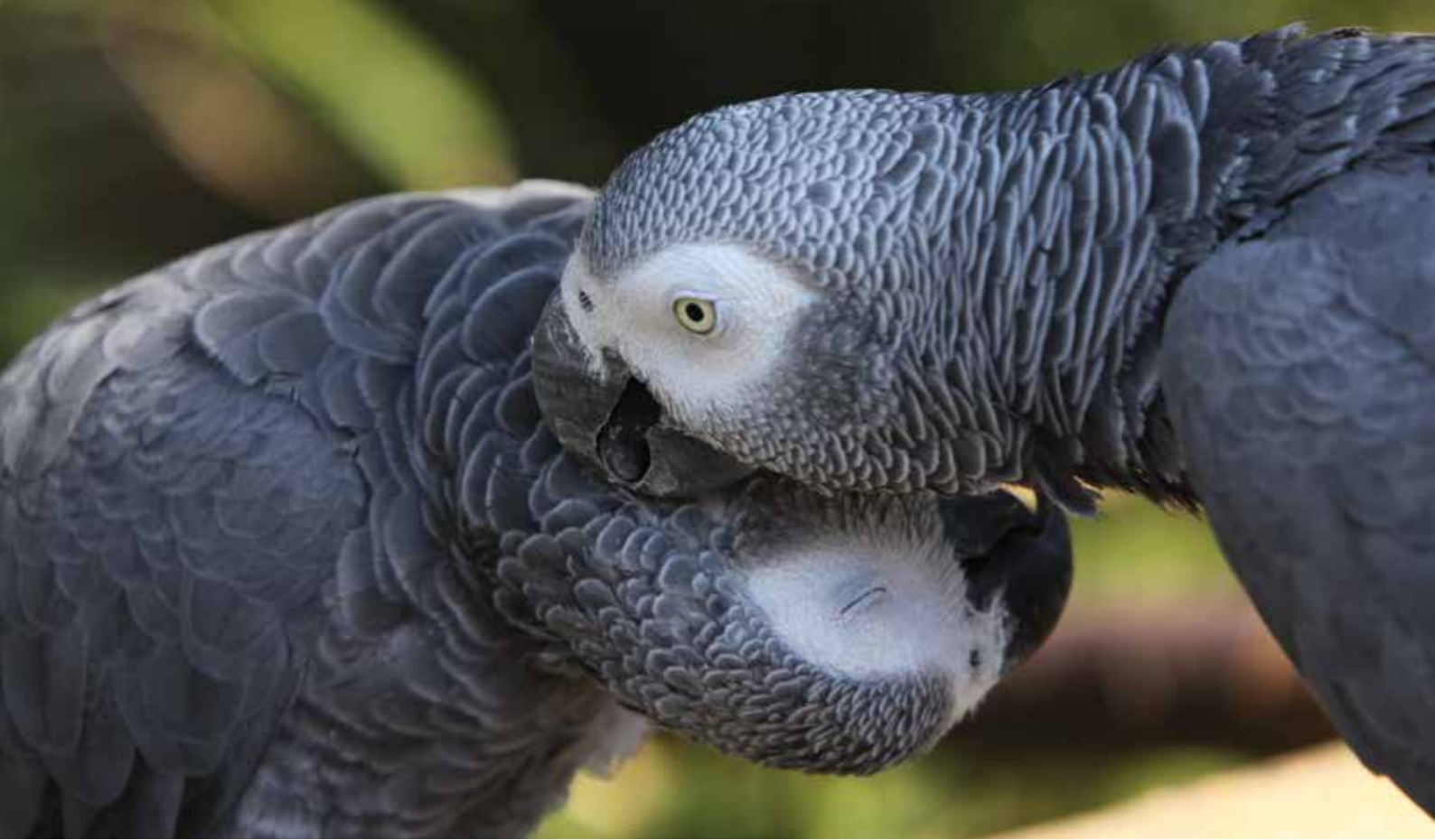
Image: Wild African grey parrots are highly social and nest in large groups, containing up to 10,000 individuals, comprising of small family groups.