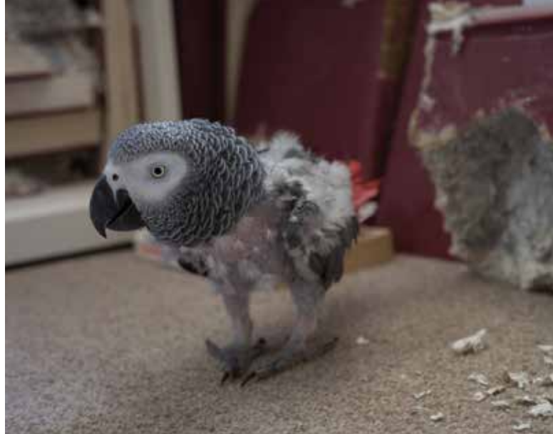
Above: Stress caused by captivity can lead to abnormal behaviours in African grey parrots, like feather plucking.

In captivity, African grey parrots have been taught to perform tasks that were once thought to be unique to humans and non-human primates. Their intelligence is yet another reason that a life in captivity is cruel. These birds need stimulation and activity to match their intelligence, yet pet-owners are rarely informed about how to care for the minds and bodies of these beautiful, social, intelligent animals.