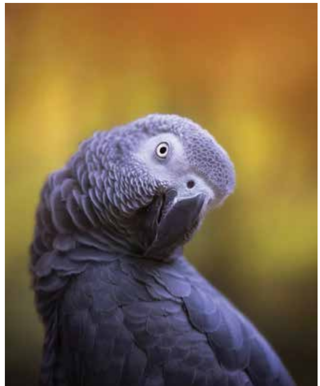
Below: An African grey parrot in the wild.

We are engaging corporate stakeholders in the industry - both the transportation industry, such as airlines and shipping companies and on the ground retailers outlets like pet stores and online platforms that support the trade in wild animals across identified consumer countries (US, Canada, Netherlands, China and United Kingdom) to inspire their awareness of the animal impact of the exotic pet trade and support the campaign.