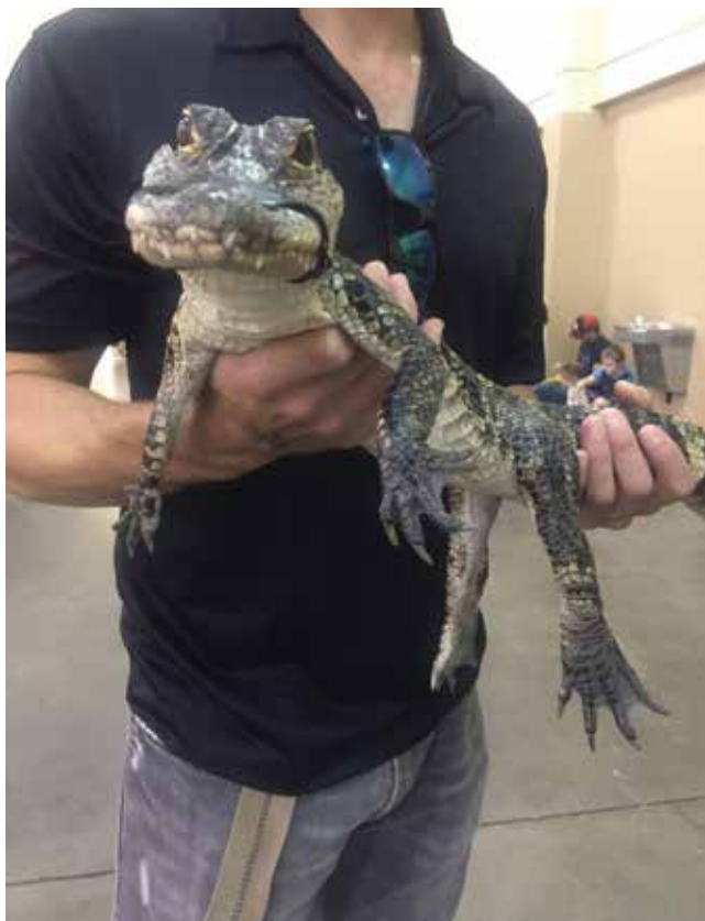
Below: A reptile at a pet expo in Florida, USA.

Currently, the annual value of the wildlife trade stands at USD30-42.8 billion. 13 Shockingly, up to USD20 billion is estimated to be illegal – a substantial proportion of this economic value is in endangered and protected species being traded as pets. But whether captive bred or poached from their wild environment, the trade has a devastating impact on the animals forced to endure a life of captivity – mentally and physically. Legal or illegal, it's all cruel.