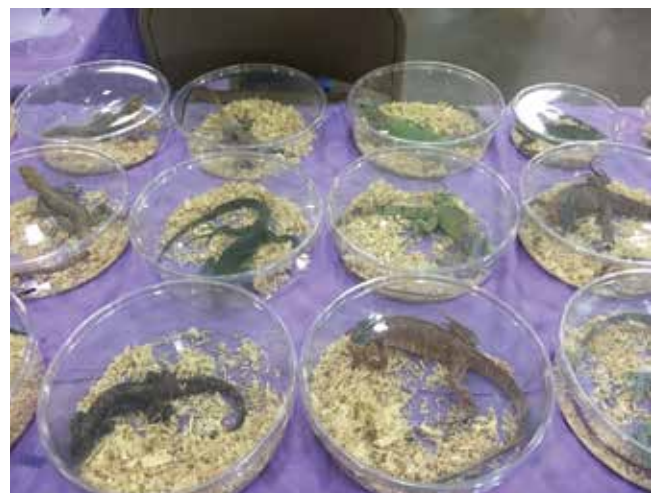
Below: Iguanas for sale at a pet expo.

There is no aspect of the exotic pet trade that is free from suffering. Ultimately that's because these animals are not meant to be pets, and therefore no amount of love, affection and quality care can ever make up for the harm that is inherent in the trade.